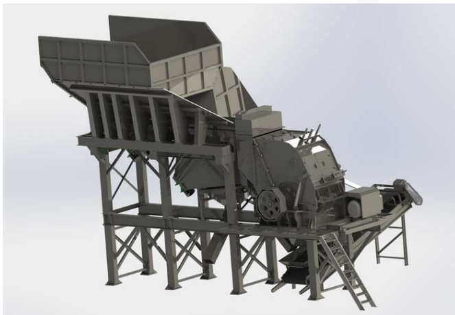
3D Image of Typical Crushing Plant

Our designs are fit for purpose to maximum the IRO of your investment.